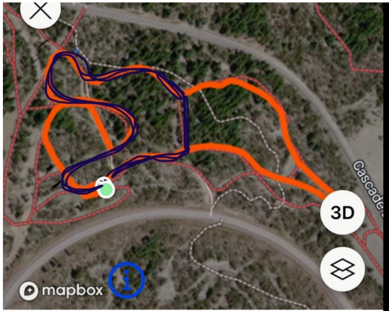
Short Course in Purple